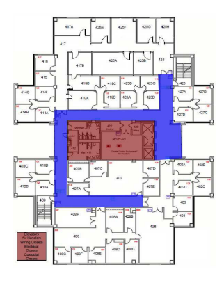
Fig. 2. HRBB Fourth Floor Floorplan with hallways highlighted blue

The environment used for testing is the fourth floor of the Bright (HRBB) Building of Texas A&M's campus in College Station, TX. A floorplan can be seen in Figure 2. The floor spans 40m of hallways 2m wide on average. In the simulation experiments, a 2D model of this environment is used. In all experiments, robots are required to visit a set of waypoints in a prescribed order (all robots start at or near a waypoint). In order to visit a waypoint, a robot must be able to query its roadmap for a path to the waypoint from the previous waypoint. The experiments test the ability of the robots to cooperate using the caravanning approach in order to visit every waypoint. A robot is successful if it can visit all the waypoints and does not collide with obstacles. The waypoints are known beforehand and common to all the robots, but do not influence the construction of each robot's roadmap.