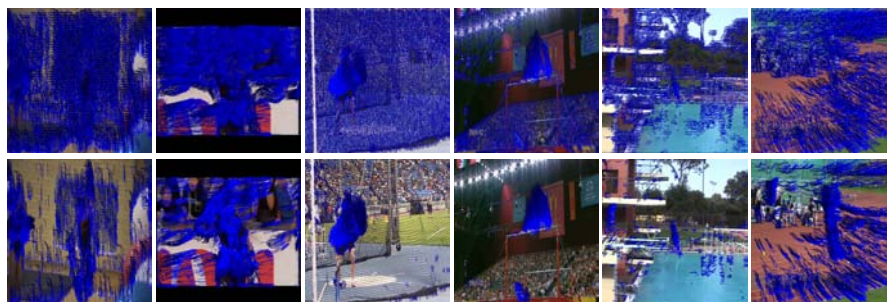
Fig. 3. Comparison between the dense trajectories and motion boundary trajectories (the first row shows dense trajectory; the second shows motion boundary trajectory)

The videos of YouTube dataset are collected from YouTube and are personal videos. This dataset is very challenging due to large variations in camera motion. In this case, the motion boundary trajectories are not very accurate. As a result, the performance of motion boundary trajectory only improve slightly that compare with dense trajectory.