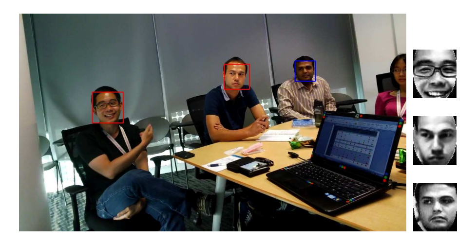
Fig. 2. Left, original image captured by Google Glass. Right, extracted normalized face images (red boxes: both eye coordinates are detected, blue box: either of the eyes is not detected). (Best viewed in color.)

per subject is available in the gallery, while remaining all face images are used as probes (termed as G1). This is similar to the commercial database of personal information containing only one mug shot image for each person. As mentioned previously and presented in the recent state-of-the-art wearable FR devices [13, 12], that keeping one mug shot image in the gallery may not be suitable for wearable FR for natural social interactions. However, in this work we perform experiments for such challenging scenarios. The FI accuracy with various features and distance measures are recorded in Table 5.