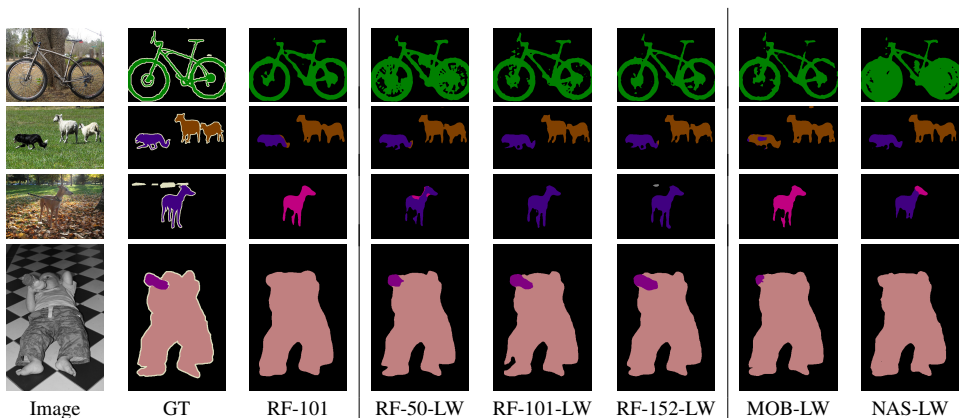
Figure 2: Visual results on validation set of PASCAL VOC with residual models (RF), MobileNet-v2 (MOB) and NASNet-Mobile (NAS). The original RefineNet-101 (RF-101) is our re-implementation.

outperform both MobileNet-v1+DeepLab-v3 and MobileNet-v2+DeepLab-v3 approaches [50], which are closely related to our method. Qualitative results are provided on Figure 2.