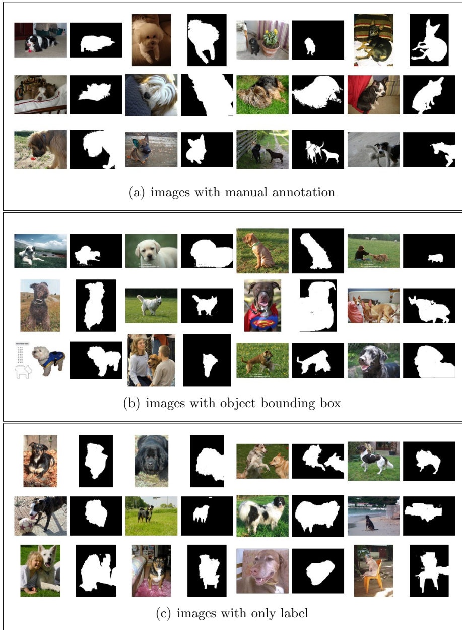
Figure 5: DogSeg training image examples.