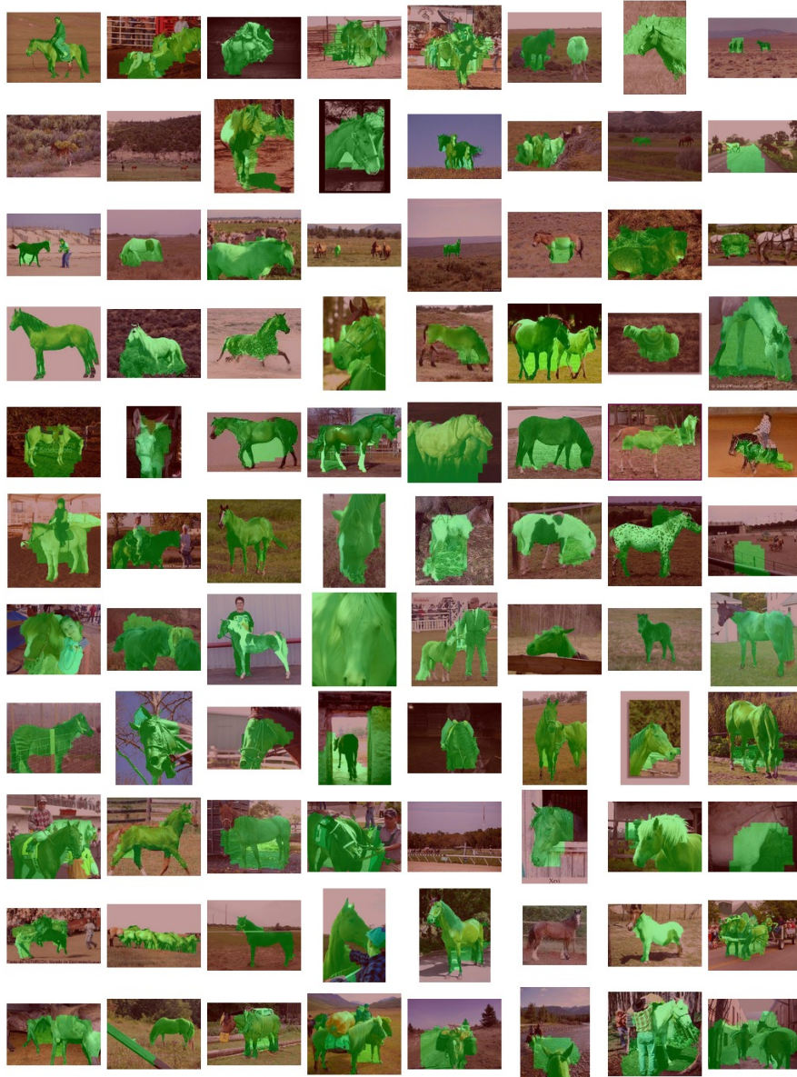
Figure 2: Test image segmentation examples from HorseSeg dataset for pairwise non-linear model trained on images with manual annotation or object bounding box (green color means foreground, red — background).