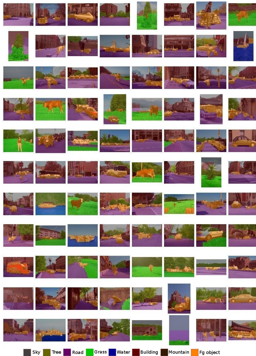
Figure 1: Image segmentation examples from Stanford background dataset for pairwise non-linear model.