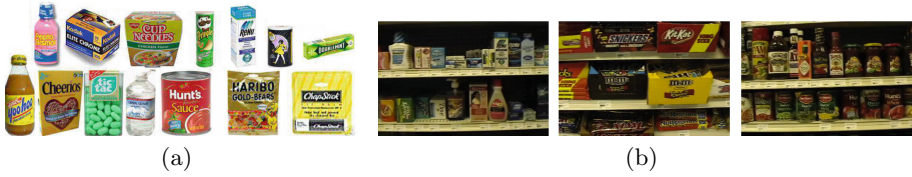
Fig. 4. Sample (a) training and (b) testing images from Grozi-120 dataset

by any image l in L when the whole set is warped to q . Finally, our context term C_L models the prior knowledge about the co-occurrence of recognized products in the query image. \alpha , \beta , and \gamma are weight parameters.