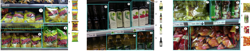
Fig. 3. Sample test images with ground truth annotations from our proposed dataset

step simultaneously localizes and infers the total number of objects present in the test image through globally minimizing an energy function.