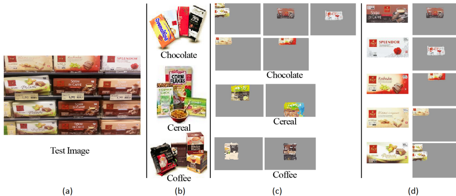
Fig. 1. System overview: (a) Given a test image, (b) we first filter the categories that the test image may belong to, (c) then we match the test image against all images in the filtered categories. (d) An energy function is then optimized given the top-ranked matches to obtain the final list, along with inferred locations, of recognized products.

of mobile phones and mobile vision systems [27,30]. A mobile vision algorithm to recognize products in an image has a wide range of potential applications, ranging from identifying individual products to provide review and price information, to the assisted navigation in supermarkets. Furthermore, mobile retail products recognition can assist the visually impaired in shopping, encouraging them to independently perform daily activities, which promotes their social wellness.