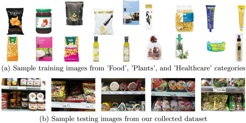
Fig. 2. Sample images from our collected dataset

There have been relatively limited research attempts to recognize products in images [27,30,15,20,33]. In systems like [15,20], a product image search engine is built. However, these systems deal with recognizing only one product per image, with training images having similar conditions to query images. In [27], cross-dataset single product recognition is targeted through query object segmentation combined with iterative retrieval. They achieve good results in searching an image that contains only a single product. In our work, however, we target multi-products image parsing.