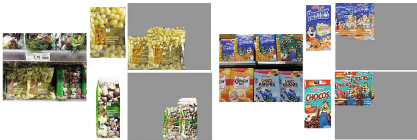
Fig. 5. Examples of two multi-label classification results. Left column shows the test image, then the retrieved products, and finally their inferred locations in the test image.

re-ranking on the top 100 images. For HE, we use k = 200,000 visual words for building the bag-of-words histogram representation which was shown to yield good performance and we use a fixed Hamming threshold h_t = 22 following [14]. Finally, we compare to the baseline method of ranking all the images by just dense pixel matching score [19] and taking the top n matches.