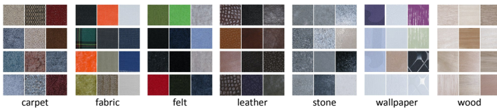
Fig. 1. Representative images for the material samples in the 7 categories

Our measured database is formed by 7 semantic classes which are relevant for analyzing indoor scenarios (see Fig. 1). To sample the intra-class variances, each of these 7 material categories of our database contains measurements of 12 different material instances. These instances share some common characteristics of the corresponding category but also cover a large variability. With a total of 84 measured material instances, we provide more than CURET, KTH-TIPS and KTH-TIPS2 (see Table 1). For each of the materials, we have measured a full BTF with 22,801 HDR images (bidirectional sampling of 151 viewing and 151 lighting directions) of a 5\text{cm} \times 5\text{cm} patch with a spatial resolution of 512 \times 512 texels. Thus, our database contains more than 1.9 million images. Additionally, for each sample, a height map has been acquired via structured light. This helps to reduce compression artifacts and allows to render realistic silhouettes. We employed a reference geometry to evaluate the RMS error between the reconstruction and the ground truth geometry which was approx. 25\mu\text{m} . The acquisition of both geometry and BTF of a material sample was achieved fully automatically in approximately 3 hours, and up to 4 samples can be acquired simultaneously. In particular, there is no need for manual annotation which is not feasible for large image collections. Our database is available at http://cg.cs.uni-bonn.de/en/projects/btfdbb/download/ubo2014/ .