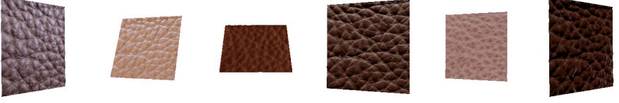
Fig. 3. Examples for synthesized images of the same material sample demonstrating the large variation under different viewing and illumination conditions

where \omega_i and \omega_o represent the incoming and outgoing light direction. L_i(\omega_i) denotes the radiance distribution in the environment map over the spherical domain \Omega . The visibility function V(\mathbf{x}, \omega_i) represents a binary indicator function considering if the environment map is visible from surface point \mathbf{x} in the direction \omega_i . To solve the integral, the Mitsuba pathtracer [34] can be used. Due to the enormous number of images we want to synthesize, the use of an efficient rendering technique is mandatory. Therefore, we decided to additionally use an OpenGL-based renderer for generating our database. To simulate the HDR environment in this renderer, we approximated it in a similar way to the work in [4] with 128 directional light sources, distributed representatively over the environment via a relaxation algorithm. In this case, the equation for evaluating the exitant radiance L_r(\mathbf{x}, \omega_o) reduces to