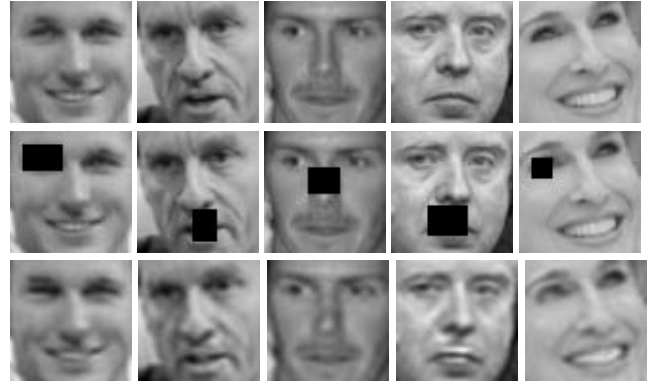
Figure 3. Five exemplary large scale inpainting results. The first row shows the original images from which large regions are removed in the second row. The last row shows the inpainting results achieved by SeDiL.