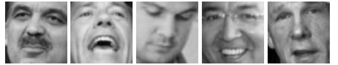
Figure 2. Five exemplarily chosen training images.

tract the global information of the underlying training set.