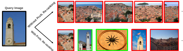
Figure 4. An example query image and the top 5 ranking results using our method with and without probabilistic ranking. Green borders indicate correct matches, and red borders incorrect ones. Without probabilistic ranking, our algorithm outputs top 5 results that are similar, but incorrect. With probabilistic ranking, more diversity is encouraged in the top ranking results, leading to correct images in the top 5 results.