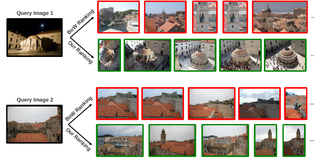
Figure 3. Two example query images and their top 5 ranked results of our method and raw tf-idf retrieval. For each result, a green border indicates a correct match, and a red border indicates an incorrect match. These two example query images are difficult for BoW retrieval techniques, due to drastically different lighting conditions (query image 1) and confusing features (rooftops in query image 2). However, with our discriminatively learned similarity functions, correctly matching images are ranked higher than with the baseline method.

Given the training data for each neighborhood, we learn a linear SVM to separate neighborhood images from non-neighborhood images, using the tf-idf weighted, L_2 normalized bag-of-words histograms for each image as features. We randomly split the training data into training and validation subsets for parameter selection in training the SVM (more details in Section 4.2). For each neighborhood centered on exemplar c , the result of training is an SVM weight vector \mathbf{w}_c and a bias term b_c . Given a new query image, represented as a bag-of-words vector \mathbf{q} , we can compute the decision value \mathbf{w}_c \cdot \mathbf{q} + b_c for each exemplar image c .