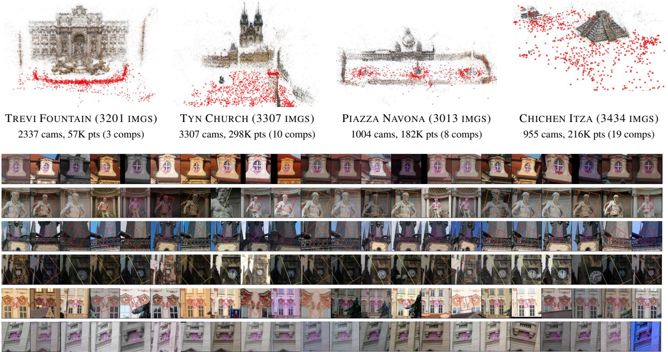
Figure 1: [TOP]: Examples of SfM reconstructions from LANDMARK-620 our Internet photo collection dataset (the largest component is shown and the number of cameras and 3D points are listed). [BOTTOM]: Six out of approx. 8 million tracks i.e. sets of matching keypoints recovered from running SfM on LANDMARK-620 (patches are visualized at their original scales).

motion [29], we construct a database of millions of feature descriptors with automatically-established scene correspondences, i.e. , we know which descriptors (from different images) correspond to the same 3D scene point, with geometric consistency guaranteed.