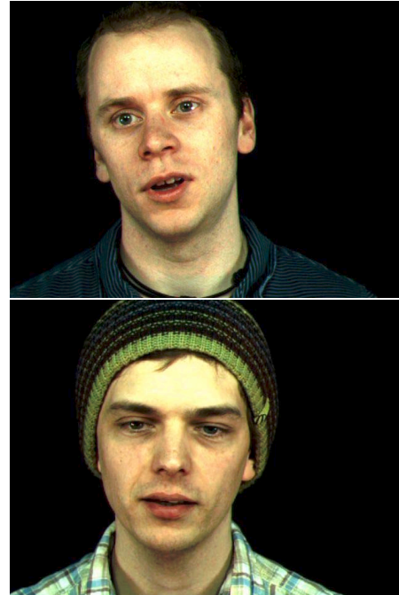
Figure 5. Example video frames from the database

expressions. Thus, the mere presence of facial motion cannot be used as an unambiguous cue for backchannel detection. The remainder of this section describes the audio and visual features extracted from the data, and discusses the results of simple experiments. As we are only interested in classifying the frontchannel, backchannel and neutral periods, only these annotations were used as classes for training/testing the SVM.