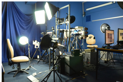
Figure 2. Setup of recording equipment

In order to capture natural, spontaneous expressions, the data needed to be captured in as natural a setting as possible. Two audio-video recording systems were set up as shown in Fig. 2. The participants were in the same room and sat opposite each other. To capture each side of the conversation the following equipment was used: a 3dMD dynamic scanner captured 3D video, a Basler A312fc firewire CCD camera captured 2D color video at standard video framerate, and a microphone placed in front of the participant, out of view of the camera captured sound (at 44.1KHz). In this paper only the 2D recordings are discussed and used; the 3D system setup and subsequent processing of that data is the subject of future work. To ensure all audio and video could be reliably synchronized, each speaker had a hand-held buzzer and LED (light emitting diode) device, used to mark the beginning of each recording session. A single button controlled both devices and simultaneously activated the buzzer and LED. No equipment was altered between the recording sessions, except for the height of the chair to ensure the speaker’s head was clearly visible by the cameras.