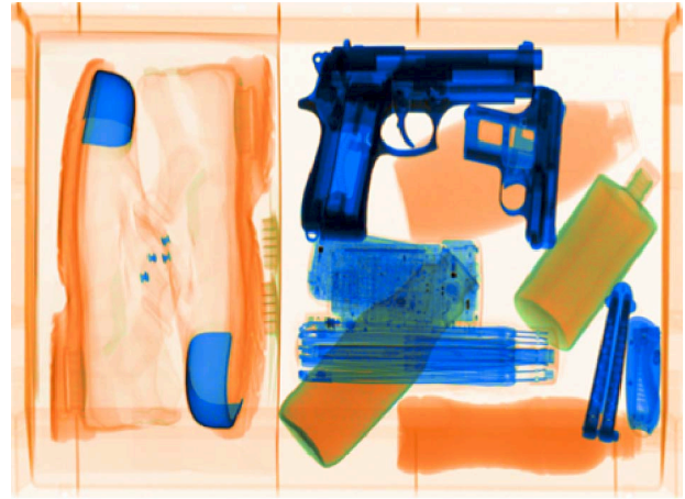
Figure 2. Generation of a pseudo-color image using dual-energy. In this example orange represents organic materials, and blue metals. The intensity of this image corresponds to the thickness of the materials (courtesy by M. Baştan [3]).

A computer vision system for single view analysis, as shown in Fig. 1, consists typically of the following steps: an X-ray image of the test object is taken and stored in a computer. The digital image is improved in order to enhance the details. The X-ray image of the parts of interest is found