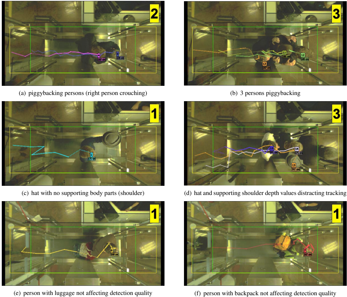
Figure 2. Resulting trajectories of our method in a framework for tracking and counting humans in a gate system