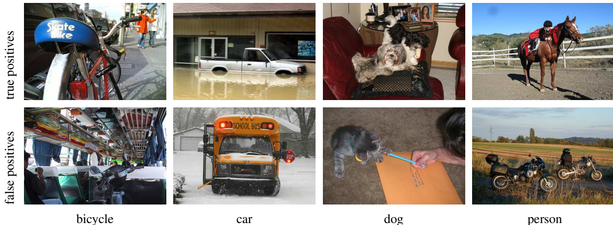
Figure 1. Sample PASCAL VOC'06 images classified with our semantic hierarchic classifier.

experimental section, incorporating the semantics into the knowledge representation leads to better recognition accuracy than relying only on straightforward reasoning, as it also allows to discover additional visual cues that would be missed otherwise. Semantic hierarchies have proved to be useful for automatic image annotation [14]. We use them to combine discriminative classifiers and thus choose a different strategy for exploiting their structure. We will demonstrate that this introduces some additional features for object detection, in particular it allows to give sensible answers in situations of uncertainty and to learn new classifiers using inference. We also go beyond the ISA relationships taking advantage of PARTOF and MEMBEROF relationships.