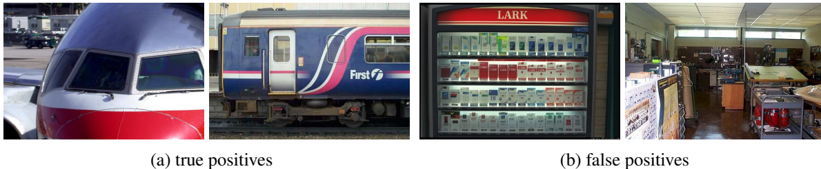
Figure 3. Sample vehicle window and machine images classified by our semantic hierarchic classifier as containing a window . Training was performed on VOC'06 images with the original annotations.

screen” and “windshield” queries and manually validating the returned images. For the negative set we have collected 120 images retrieved with the “machine” query. Section C of table 1 shows the results for these test images; training was performed on the VOC'06 images with the original labels. For the OAR and AVH methods post-classification reasoning was performed (“if there is a car or bus than there is a window”). The SSH classifier could not perform the task as it was trained without meronymy/holonymy relationships. Our ESH classifier shows significantly better performance than the methods only extended with reasoning. This confirms that the classifier was able to generalize over the windows of cars and buses. Fig. 3 illustrates examples for detecting individual windscreens and windows of different vehicles. Even some false positives on window-like structures were observable, see fig. 3. We conclude, that our classifier is able to learn the generalized visual appearance of unseen object classes through inference.