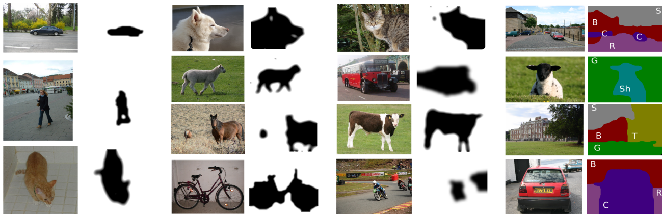
Figure 5. Examples of segmentation obtained by our method for the Graz-02, Pascal VOC 2006 and Microsoft (best viewed in color) datasets. For the latest the following coding is used: G for grass, Sh for sheep, S for sky, B for building, T for tree, C for car.