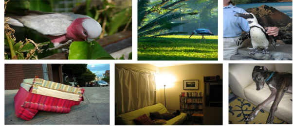
Figure 2. Images from the Pascal VOC 2007 dataset for two different categories: birds (first line) and sofa (second line).

However segmentations obtained by MRFs without shape models rarely produce accurate segmentation, thus several authors tried to merge these two concepts. One of the most noticeable work is the one of Kumar et al. [5] who propose a methodology for combining CRFs and pictorial structure models. Leibe and Schiele [6] use hand segmented images to learn segmentation masks corresponding to visual