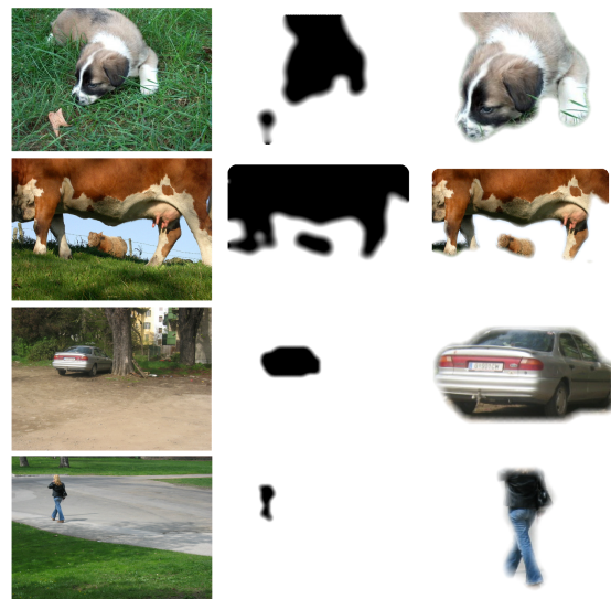
Figure 1. Instances of object categories are localized in images (col 1), producing masks (col 2) that can be used to automatically extract objects (col 3). The proposed method automatically produces these segmentation masks without any user interaction.

The problem addressed here is the segmentation of ob-