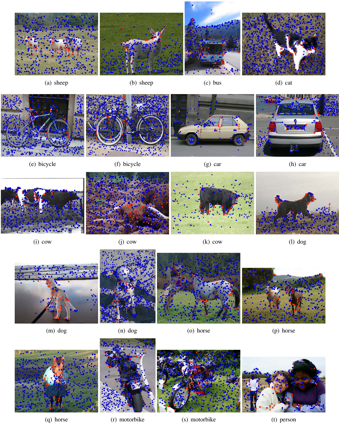
Figure 4. Example images from the PASCAL VOC 2006 database. The presence of highly-weighted interest points (marked in yellow face/red edge) on objects that correspond to the category of interest demonstrate that our algorithm correctly learns the association between the right features and the category in spite of weakly-labeled data. Remaining interest points found by the detector are shown in black face/blue edge.