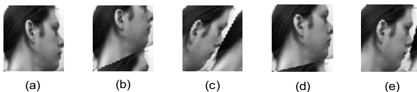
Figure 2. Original image and transformed directional images. (a) Original 2^{\text{nd}} order tensor image; (b) mode-1 directional image with l=2 ; (c) mode-2 directional image with l=2 ; (d) mode-1 directional image with l=4 ; (e) mode-2 directional image with l=4 .

A general framework for independent feature extraction with tensor representation was proposed in this paper. The proposed method learns multiple low-dimension subspaces to extract independent features. A novel mode- k directional image formation was used in training to better exploit the directional information in the mode- k matrix of the tensor. Then the mode- k ICA was presented to learn the subspaces via mode- k directional images and finally the multilinear directional ICA algorithm was presented to extract the IC features, which is also in a tensor form. Compared with the traditional ICA algorithms, the proposed method alleviates significantly the small sample size problem and can preserve better the structural information embedded in the tensor datasets. From the experiments on one palmprint database and two face (UMIST and AR) databases, it can be concluded that the proposed algorithm has higher classification accuracy than many existing unsupervised algorithms such as PCA, ICA and 2DPCA, and even supervised algorithms such as FLD, 2DFLD and Tensor-FLD.