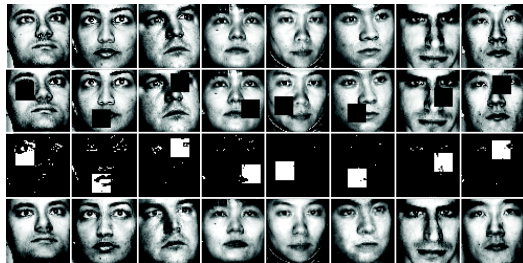
Figure 2. Demonstration of occlusion detection on the CMU PIE database. Original samples are displayed in the first row. An 18-by-18 occlusion is randomly generated as shown in the second row. The third row shows the error maps derived from our algorithm, and the recovered images are demonstrated in the bottom row.

Shan et al. [8] proposed to add virtual training samples with manual misalignments for bridging the distribution gap between training data without spatial misalignments and testing data with spatial misalignments. Our formulation in this work is different from [8] in several aspects: 1) the work [8] cannot handle image occlusion; 2) the work [8] cannot work under scenarios where the training images are already cropped; 3) the virtual samples essentially make the classification hyperplane more nonlinear and thus maybe beyond the capability of linear subspace techniques; 4) it cannot estimate the exact spatial misalignment parameters or occluded areas; and 5) our proposed formulation is general and can be used under scenarios with both spatial misalignments and image occlusions, and it can also be used for both misalignment and occlusion estimation. Moreover, our formulation can also work on the derived subspace from the training set with virtual samples to further improve algorithmic performance on testing data with unforeseen spatial misalignments.