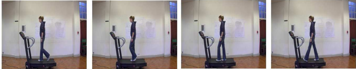
Fig. 1. Example frames from sequence that was hand labeled to learn the model of a Human.