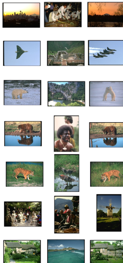
Figure 2. Comparisons of nearest images identified by citation- k NN with/without metric learning. The first column shows some test images; the second/third columns show the nearest reference image in training set identified by citation- k NN without/with metric learning, respectively.

Figure 2 shows some example test images and the nearest images identified by citation- k NN with/without MIML distance metric learning. We clearly observe that by using metric learning, the nearest neighbors are semantically more relevant to the test images than without using metric learning, which further validates the efficacy of the pro-