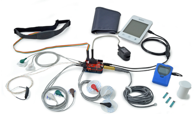
Figure 3. e-Health Sensor Platform

The e-Health Sensor Shield V2.0 allows Arduino and Raspberry Pi users to perform biometric and medical applications where body monitoring is needed by using 10 different sensors (Figure 3): pulse, oxygen in blood (SPO2), airflow (breathing), body temperature, electrocardiogram (ECG), glucometer, galvanic skin response (GSR - sweating), blood pressure (sphygmomanometer), patient position (accelerometer) and muscle/electromyography sensor (EMG) [14].