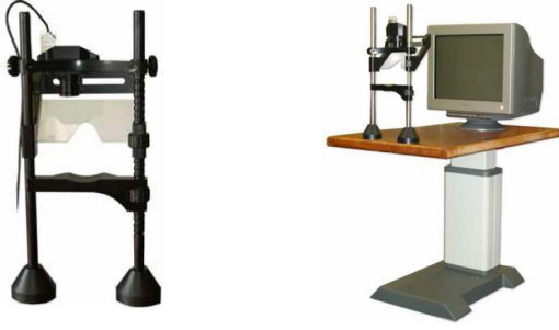
Fig. 1. Eye tracking apparatus