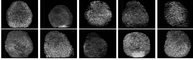
Fig. 1. Ten sample images in the NIST fingerprint database.

success rate P_s for correctly recognized data: