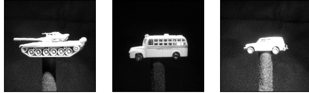
(a) Tank (b) School Bus (c) Truck