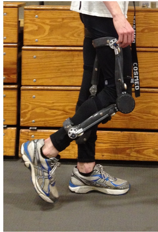
Fig. 3. Clutch-spring knee exoskeleton, as worn here.