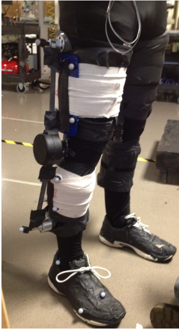
Fig. 4. Right leg instrumented for motion capture. Black tape covers all reflective surfaces.

foot, fifth metatarsal). For inactive and active trials, the termination points of the exoskeletal spring were also marked. The marker set for the right leg is shown in Figure 4. Motion data were recorded at 120Hz and low pass filtered using a 2nd order Butterworth filter with a 10Hz cutoff. Ground reaction forces were recorded at 960Hz from a dual belt instrumented treadmill (BERTEC, Columbus, OH, USA) and low pass filtered using a 2nd order Butterworth filter with a 35Hz cutoff. Following calibration using a static standing trial, Visual3D (C-Motion Inc, Germantown, MD, USA) modeling software was used to reconstruct joint kinematics and kinetics and center of mass trajectories, assuming right-left leg symmetry.