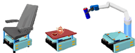
Fig. 1: Typical combinations of MOVEMENT platform with various application modules for moving people and objects (early concept sketches)

mobility tasks. Another possible user group includes persons who normally are not able to control a wheelchair (e.g. in case of spasm or athetosis) and thus also profit from the system developed within the MOVEMENT project. Given the broad range of potential users the MOVEMENT setup provides several possibilities to command/drive the system in a manual, an assisted or an autonomous mode.