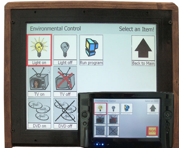
Fig. 5: User Interface presented on two different touch screens

Since the UI and the ICT terminal in their core use the same software it is ensured, that the user will find preferred settings and functionality as well as a familiar look on both of the modules. Figure 5 shows in comparison both the screen of the ICT and the smaller UI on the chair.