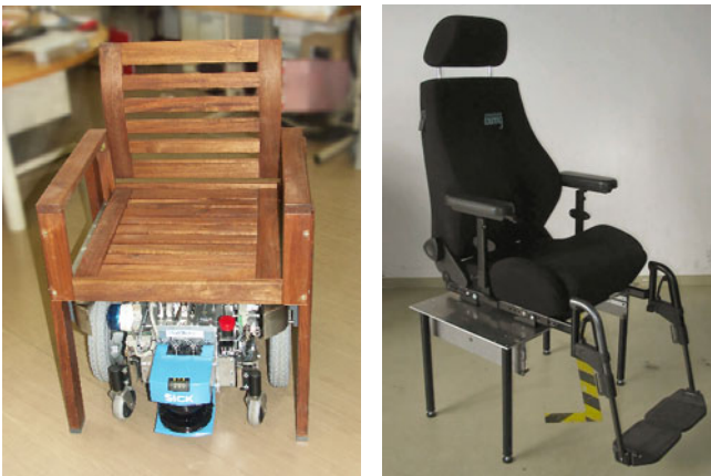
Fig. 4: Off the shelf chairs adapted with MOVEMENT docking system in order to be moved by the robotic platform. In addition to the sensor systems used in MOVEMENT (binocular stereo vision and 3D TOF sensor) and for the first test phase an additional laser scanner (LMS200, SICK) is mounted to the mobile platform in order to serve as a reference system (left image).

According to the evaluation concept of MOVEMENT there will be three different prototypes realized during the project. The first prototyping stage (PT1) includes the robot platform (including global/local navigation features) as well as three different versions of “chair” modules (one standard chair, two chairs with adapted seat - Fig. 4) and an environmental control terminal module (ICT terminal) as application modules.