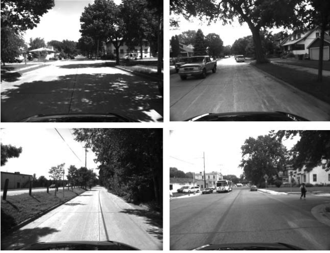
Fig. 1. Some images from the dataset used for the experiment. The entire video sequence can be found at [26].

axes are shown. From these, we observe that the algorithm obtains accuracy ( 3\sigma ) better than 1^\circ for attitude, and better than 0.35m/sec for velocity in this particular experiment.