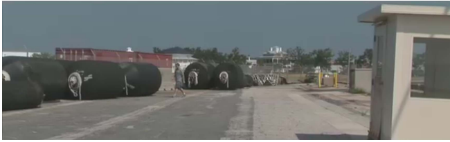
Figure 1 The pier

Consider a scenario in which you are asked to find an intruder hiding on a cluttered pier. To support your search, you are provided a team composed of an additional human and five robots. Your task is to coordinate your team to apprehend the target. This hypothetical scenario is one we demonstrated with real robots on the pier facility shown in Figure 1. While there are plenty of issues to address including robot capabilities, sensor limitations, and localization, we focused on the coordination aspects of the task. We specifically designed the task to have more robots than a single individual could easily handle. We also wanted to make sure the scenario included more than one human, since this provides its own challenges.