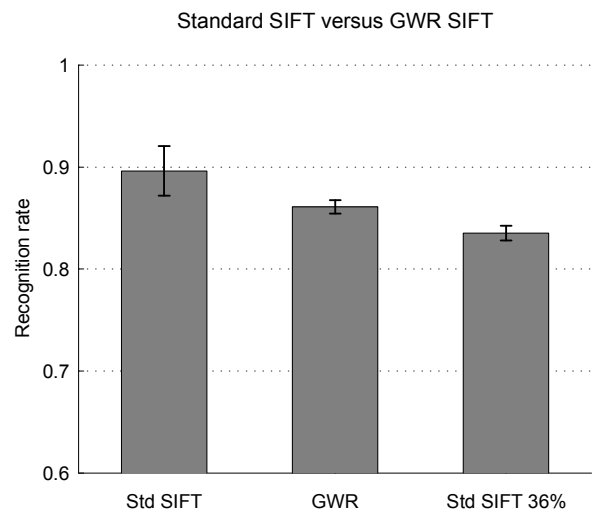
Fig. 4 The mean recognition rates for standard SIFT, the GWR-network and standard SIFT using 36% of the keypoint database. Standard SIFT uses on average 6429 keypoints. The GWR-network has on average 2396 keypoint clusters (37% of standard SIFT). For the GWR-network and SIFT using 36% keypoints, the data is acquired from 10 experimental runs. The error bars give the 95% confidence intervals.

The active approaches clearly outperform the passive approach. Already with one viewpoint, the use of active vision to select stable object keypoints gives significantly better