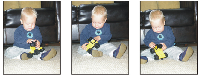
Fig. 1. A 18 months old child exploring an unknown object. This enables the child to observe the object from different viewpoints. In the meanwhile, it makes it possible to discriminate the object from the background.

THE real world poses many challenging problems for artificial systems. Consider for instance the problem of recognizing objects in the real world. Many object recognition systems that are successful in controlled laboratory environments have problems with the uncontrolled and unpredictable properties of the real world. Whereas, for instance, illumination and background can be controlled in an artificial setting, this is not true for real-world environments. Natural systems deal with these problems by using active perception [8]. Instead of passively observing an object, many animals, including humans, explore the object to control the visual input (see fig. 1). The use of active perception is also very important for artificial systems [1, 21]. In this paper, we discuss an active approach to 3D object recognition in the real world by an autonomous robot. By actively changing viewpoint, the robot observes an object from different angles, making it possible to learn to recognize the object from any given viewpoint. Moreover, the system selects the viewpoint that is expected to be most informative for recognition. Fur-