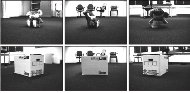
Fig. 2 A number of images from our database.

In the next step, we segment the stable keypoints belonging to the background from those belonging to the object. Each keypoint \mathbf{k}_i has a position (x_i, y_i) at which it is observed in the image. Since the object is in the center of rotation, object keypoints will move little when the robot is exploring the object, whereas the displacement will be relatively large for keypoints in the background. Furthermore, since the robot moves on a flat surface, keypoints will only move in the horizontal direction. Allowing some fluctuations, we classify a stable keypoint as an object point when