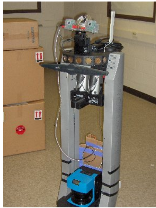
Fig. 1. The robot used in the study. As can be seen from the image, the robot has no distinguishing gender features.

The first step was to determine if the subjects perceived the different voices used in this study as equally understandable. One of the items on the post-experiment survey was intended to serve as a manipulation check in this regard. An Entity Type \times Voice Gender \times Subject Sex ANOVA of the ratings for the understandability item revealed a significant main effect for Voice Gender ( F(1, 36) = 4.90, p = .03 ) as