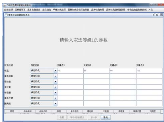
Figure 2 Interface Please Input Parameter of Grey Selection Degree 1

Choose characters to be evaluated, click the button Operation and Next respectively, and get into the interface Please Input Parameter of Grey Selection Degree 1 (Figure 2).