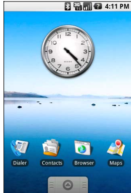
Figure 1. The Android desktop.

Previously, mobile phone OSs have been proprietary, leading applications to be tied to a specific carrier and phone. The iPhone, for instance, has restrictive licensing terms that allow only applications approved by Apple to be distributed publicly [5]. Android's open nature is intended to set a new standard for mobile phone OSs. Applications can be written once and then run on a variety of phones and carriers. As such, Android is available as open source software under the Apache License [6].