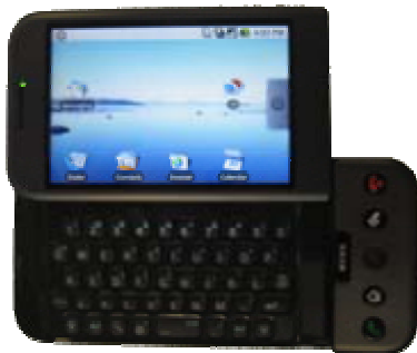
Figure 2. T-Mobile G1.

T-Mobile released the G1 phone, running the Android platform, in October 2008 (see Fig. 2). Subsequently, Google began selling an unlocked version of the G1 as the Android Dev Phone 1 to developers. The Android Dev Phone 1 is not limited to the use of T-Mobile SIM cards and applications may exploit some features that are limited in the consumer version of the phone [7].