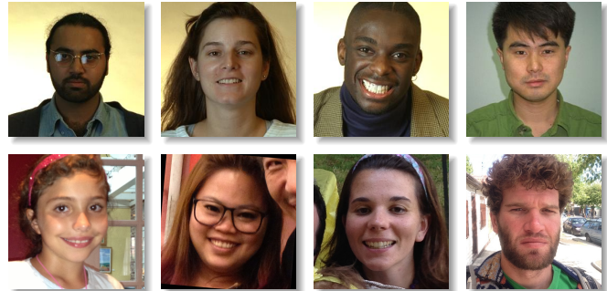
Fig. 1. An impression of the challenging task of face gender classification. Top row: face images from the color FERET dataset [5], [6]. Bottom row: face images from the Adience dataset [3]

The contributions of this paper. In order to investigate