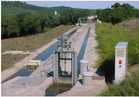
Figure 1: Experimental water canal at the University of Évora.