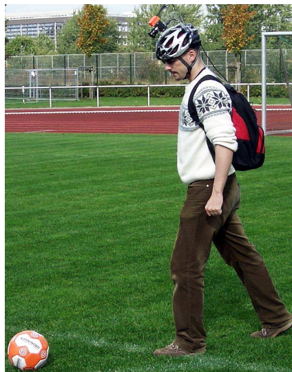
Figure 2: Our proposed experiment: Mount a camera and an inertial sensor on the head of a human soccer player and use them to extract all the information, a humanoid soccer robot would need to take the human's place.