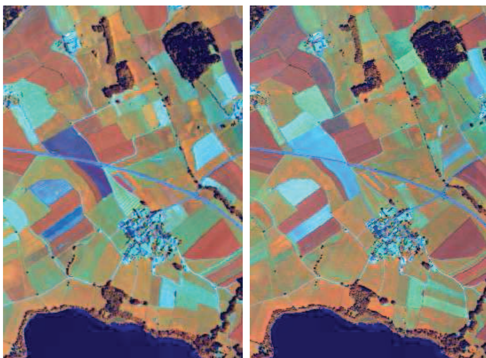
Figure 1. HyMap bands 27 (828 nm), 81 (1,648 nm) and 16 (662 nm) as RGB, 30 June 2003 8:43 UTC (left) and 4 August 2003 10:23 UTC (right).