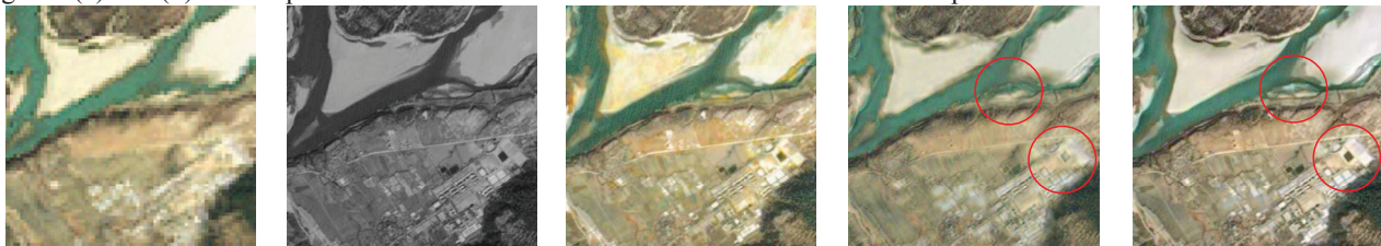
(a)MS image (b)Pan image (c)IHS Fusion (d)Ehlers Fusion (e)FMADDCMI

Here, a 28.5m resolution of ETM+ image and a 5m resolution of IRS image of the same area are selected for experiment. Band1, band2 and band3 of ETM+ for MS image, which was obtained in 2001, and the IRS Pan image’s time is 2005, seeing Figure 2(a) and (b). The experiment uses HIS Based Fusion and Ehlers Fusion to compare with FMADDCMI.