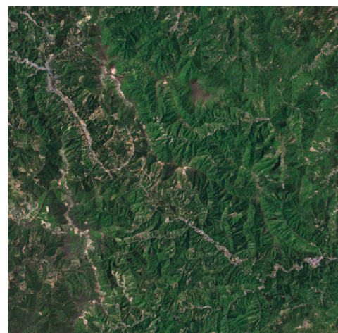
(b) After correction