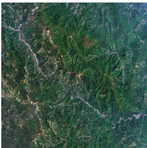
(a) Before correction

In this paper, we propose a new region based method for correcting the atmospheric effects, which vary not only horizontally but also vertically. The method is applied to a Landsat TM data (p107r37) of May 29, 1996 over Kitakami mountainous area. The effectiveness of the method is shown in Fig.1, where two true color composites, (a) before correction and (b) after correction, are compared.